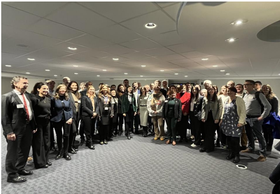
Figure 2: Mariya Gabriel, Commissioner for Innovation, Research, Culture, Education and Youth together with European Innovatino Ecosystems Programme Project Coordinators

and strengthening innovation in European Innovation Ecosystems across the EU and addressing the innovation divide”.